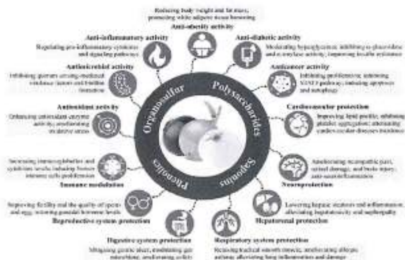
Fig. 2. Health benefits of onions