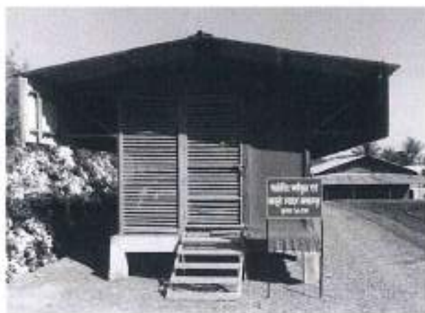
Fig. 4. High volume structure

These current prevailing structures that may vary in their capacity as well as the cost to fulfil the requirements of all income groups of farmers/traders. Though these naturally ventilated storage structures are well adopted, still considerable losses occur as there is no control of temperature, relative humidity and airflow which are very important for successful storage of onion with minimum losses. The construction of the 50 MT double row modified bottom and side ventilated storage structure needs approximately Rs. 7 lakhs.