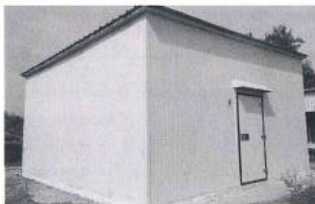
Fig. 5. Controlled storage structure