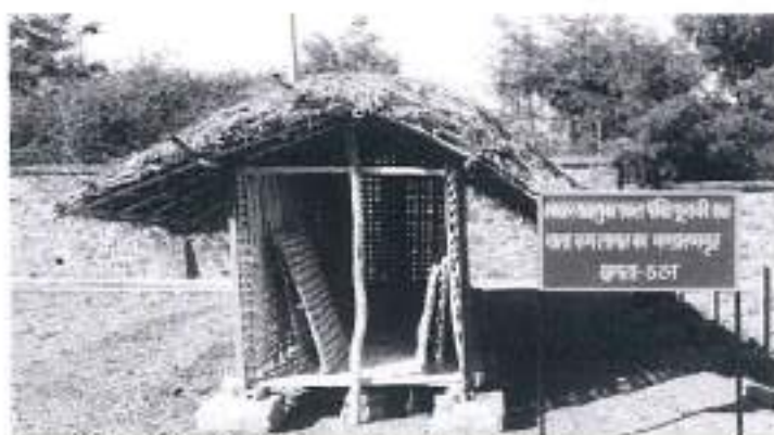
Fig. 3. Low volume structure